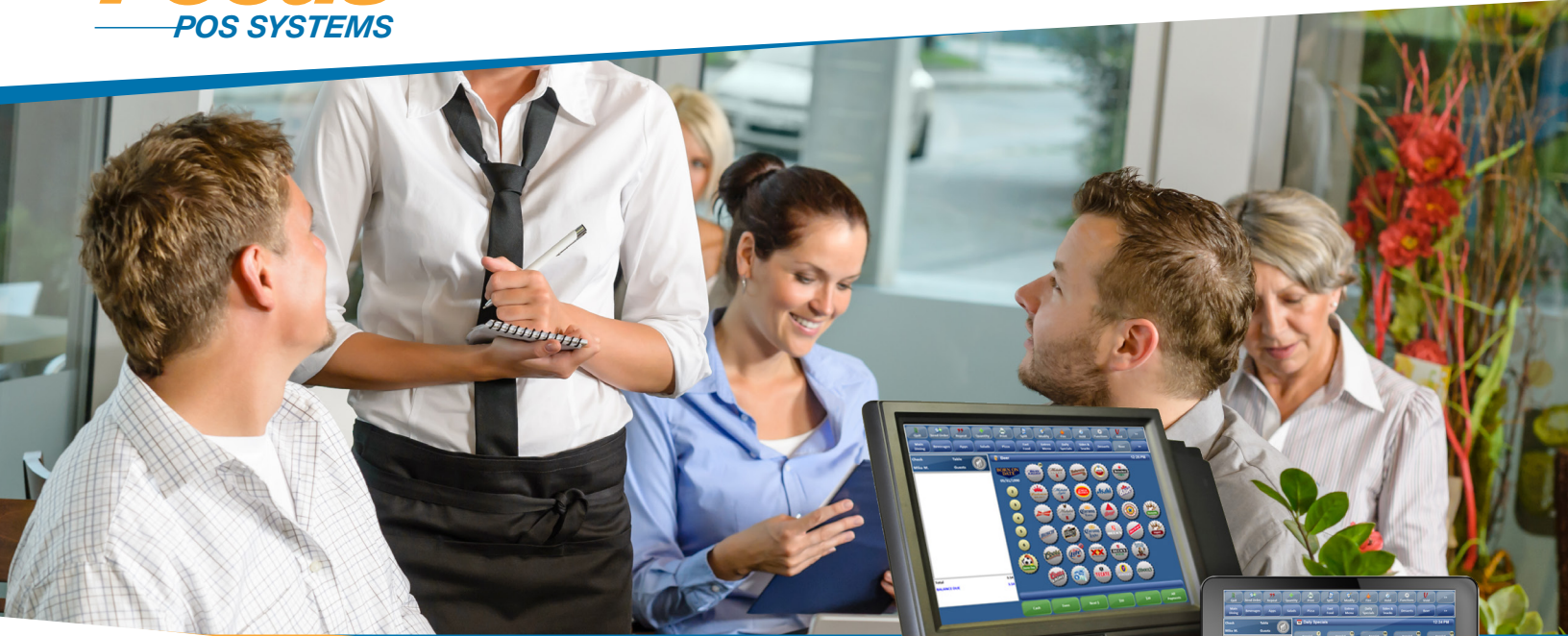
Table Service POS

From long wait times, to slow service and incorrect orders, a number of factors can lead to a poor experience at your restaurant. Focus POS helps busy restaurants manage table seating, increase table turnover and average ticket size to increase the profitability of their operations. Focus Table Service POS enables restaurants to optimize labor and streamline food preparation to ensure the best possible service.